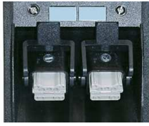
Non standard plug connections